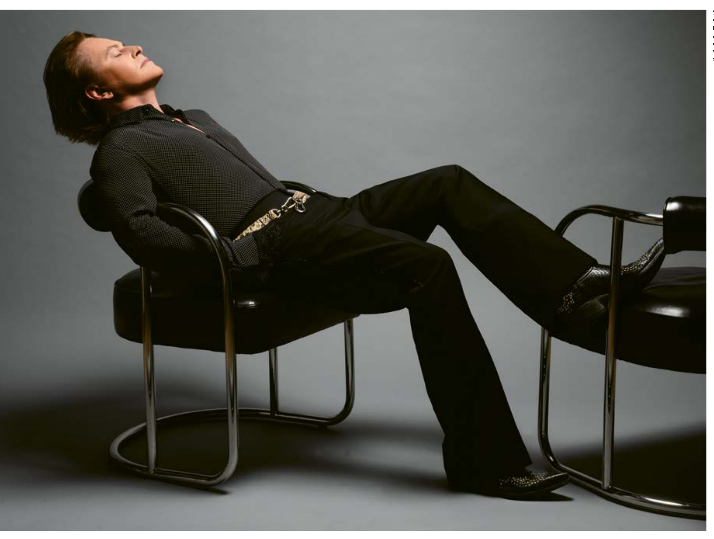
Saint Laurent shirt and pants, Prada python belt and old Gringo custom snake skin boots with sterling nail heads.

about as well is a project at Hudson Yards in New York City.