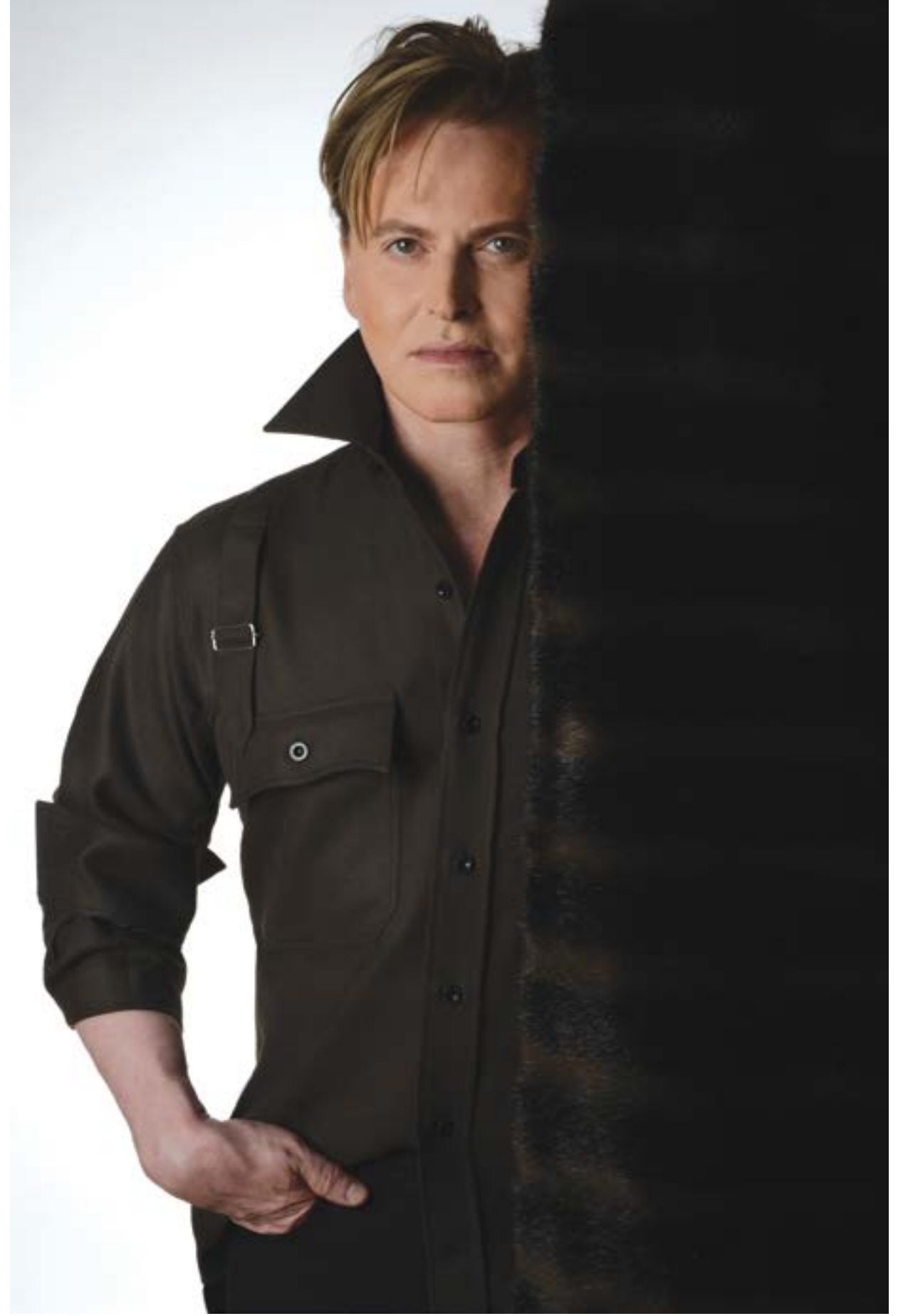
Shirt by Alexander McQueen.