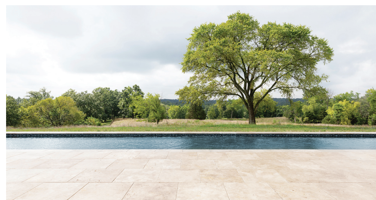
A long lap pool slightly offset from the main house provides unobstructed views of the rural countryside.

A master of subtle details, Amy knows how to make an impact without overwhelming the senses. "Everything is about the view," she explained and added that the muted tranquility of the interiors reflects a desire for the home to serve as a sanctuary for its occupants.