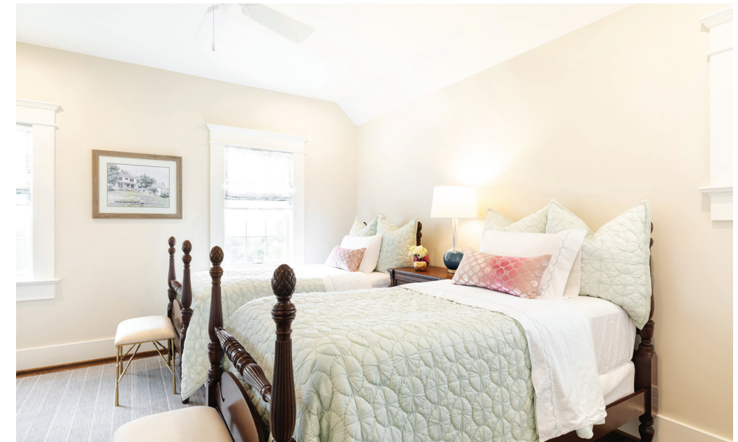
Matelassé bedding is paired with velvet and silk accent pillows in a second floor guest bedroom.