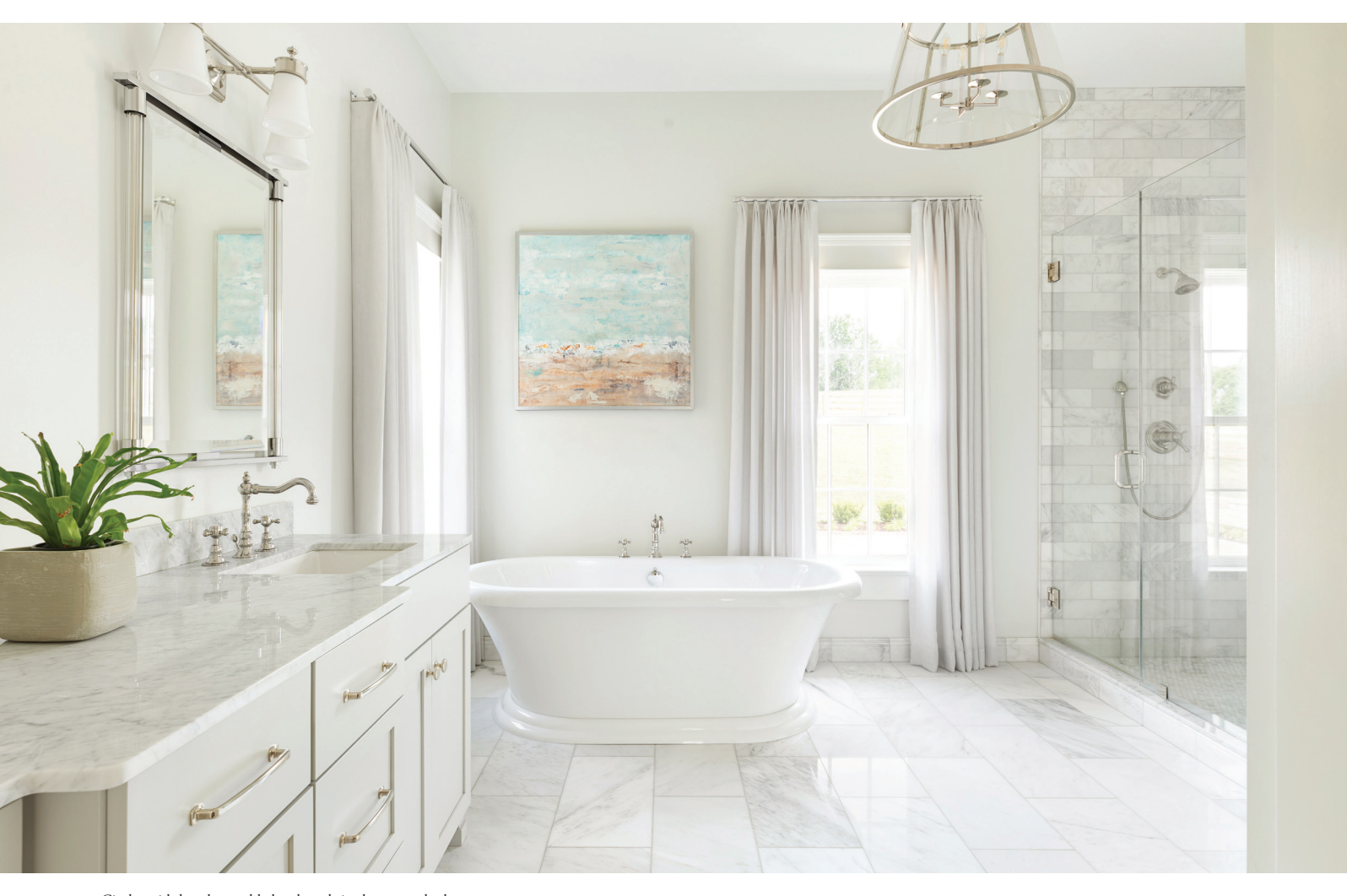
Cimba said that the marble baseboards in the master bathroom, "snap things up immediately." She also loves adding drapery to a bathroom to add a touch of opulence.