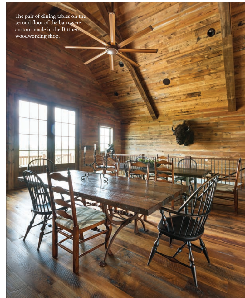
The pair of dining tables on the second floor of the barn were custom-made in the Bittners woodworking shop.

The workshop's open concept floorplan includes a combination kitchen and living space on the first floor and an upstairs bunkroom that is able to accommodate up to eight guests, via built-in bunkbeds and a queen-sized bed with a custom headboard fashioned from exotic hardwoods by the Bittners woodworking studio.