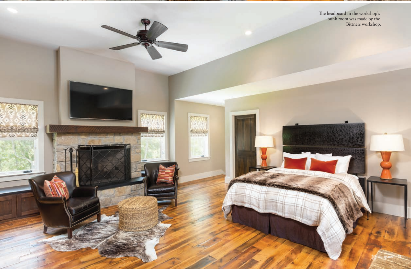
The headboard in the workshop's bunk room was made by the Bittners workshop.