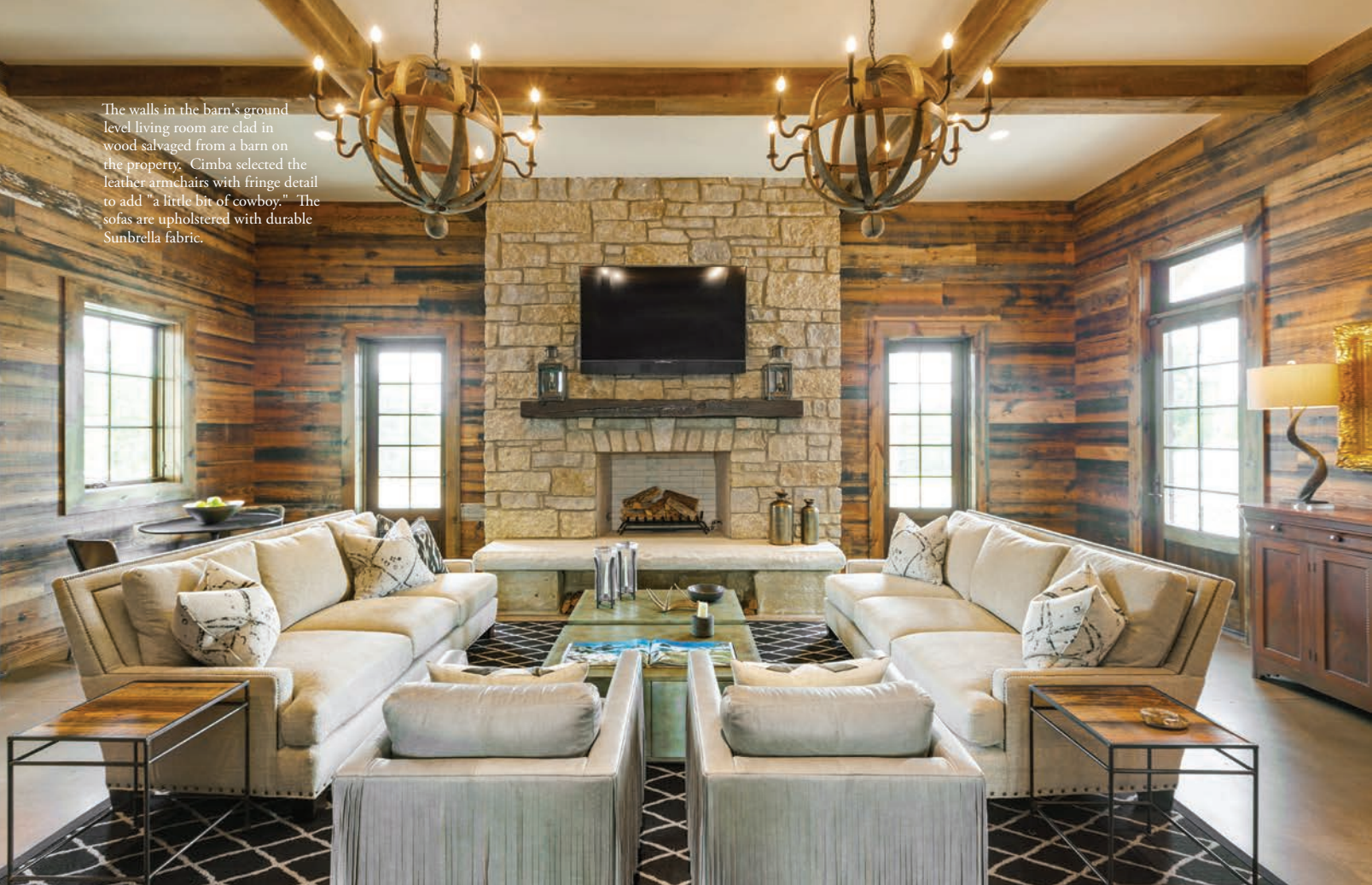
The walls in the barn's ground level living room are clad in wood salvaged from a barn on the property. Cimba selected the leather armchairs with fringe detail to add "a little bit of cowboy." The sofas are upholstered with durable Sunbrella fabric.