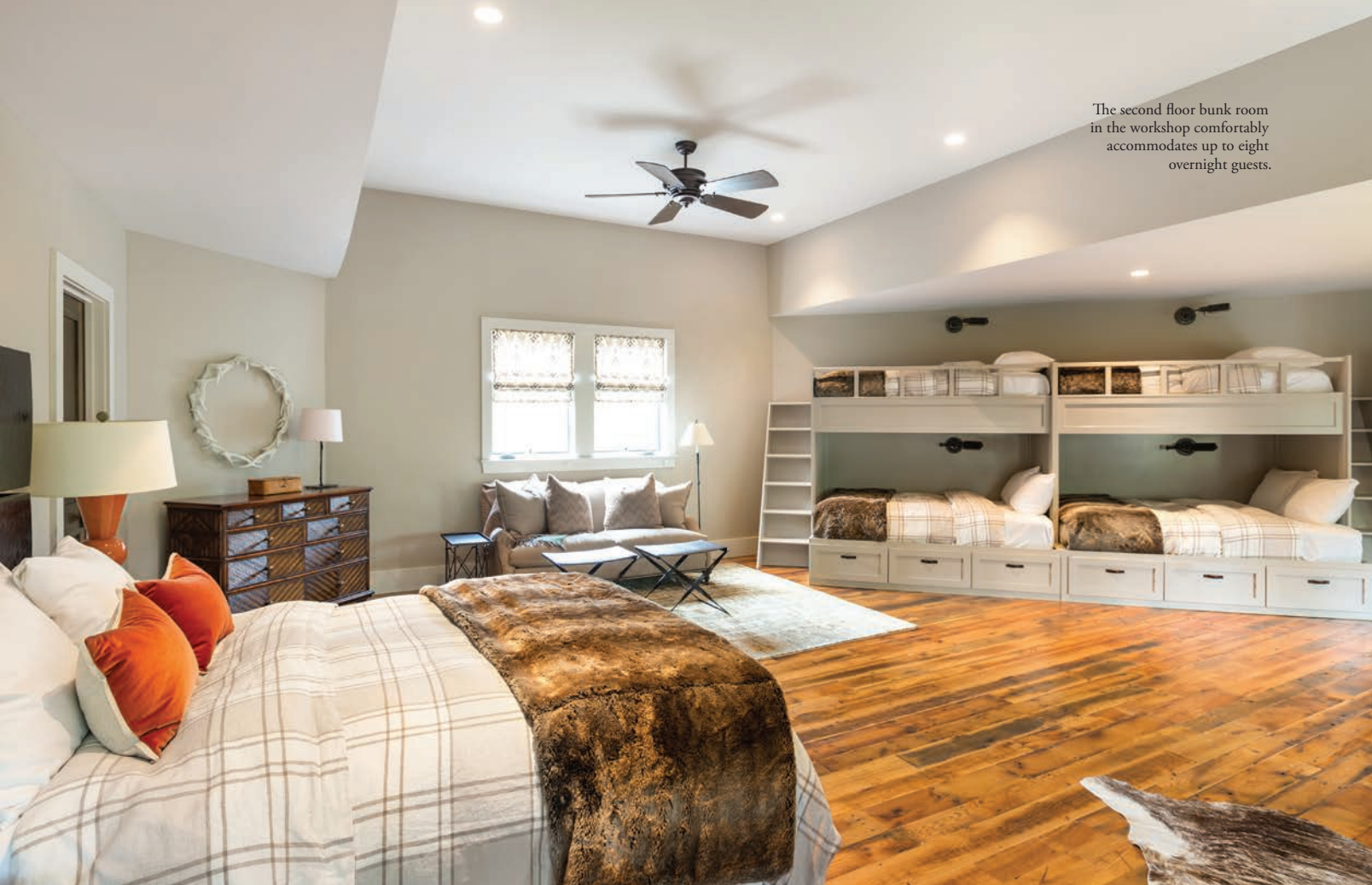
The second floor bunk room in the workshop comfortably accommodates up to eight overnight guests.