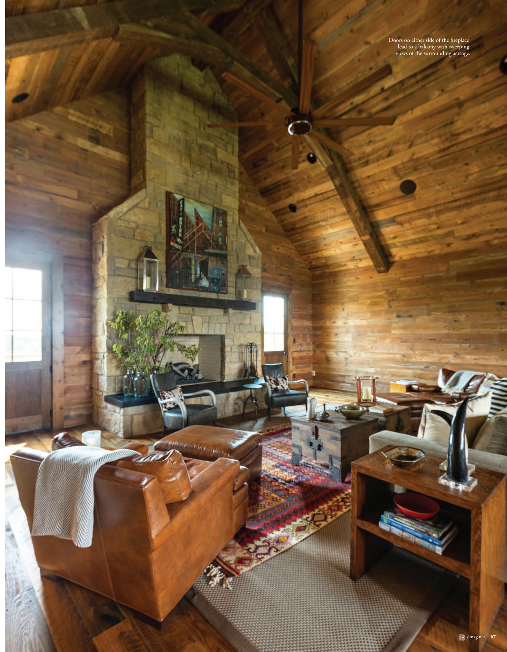
Doors on either side of the fireplace lead to a balcony with sweeping views of the surrounding acreage.

Sharing a similar floorplan of a central two-story living space flanked by garages and storage space on either side, both the workshop (designed by architect Tim Winters), and the barn (credited to Tennessee architect Steve Durden), were built by Aaron Esposito of Esposito Construction. While the pair of structures also share a number of interior design elements (a given in this rural setting), it is the scale and site placement of each that makes them truly unique. The cozier workshop is nestled among the trees just below a small rise that falls off sharply to a creek; the barn is located at the heart of the farm, and its scale appears even more grand in this pastoral setting.