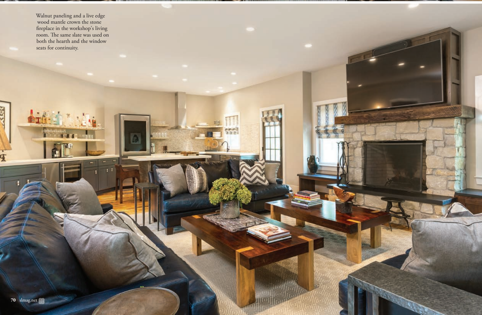
Walnut paneling and a live edge wood mantle crown the stone fireplace in the workshop's living room. The same slate was used on both the hearth and the window seats for continuity.