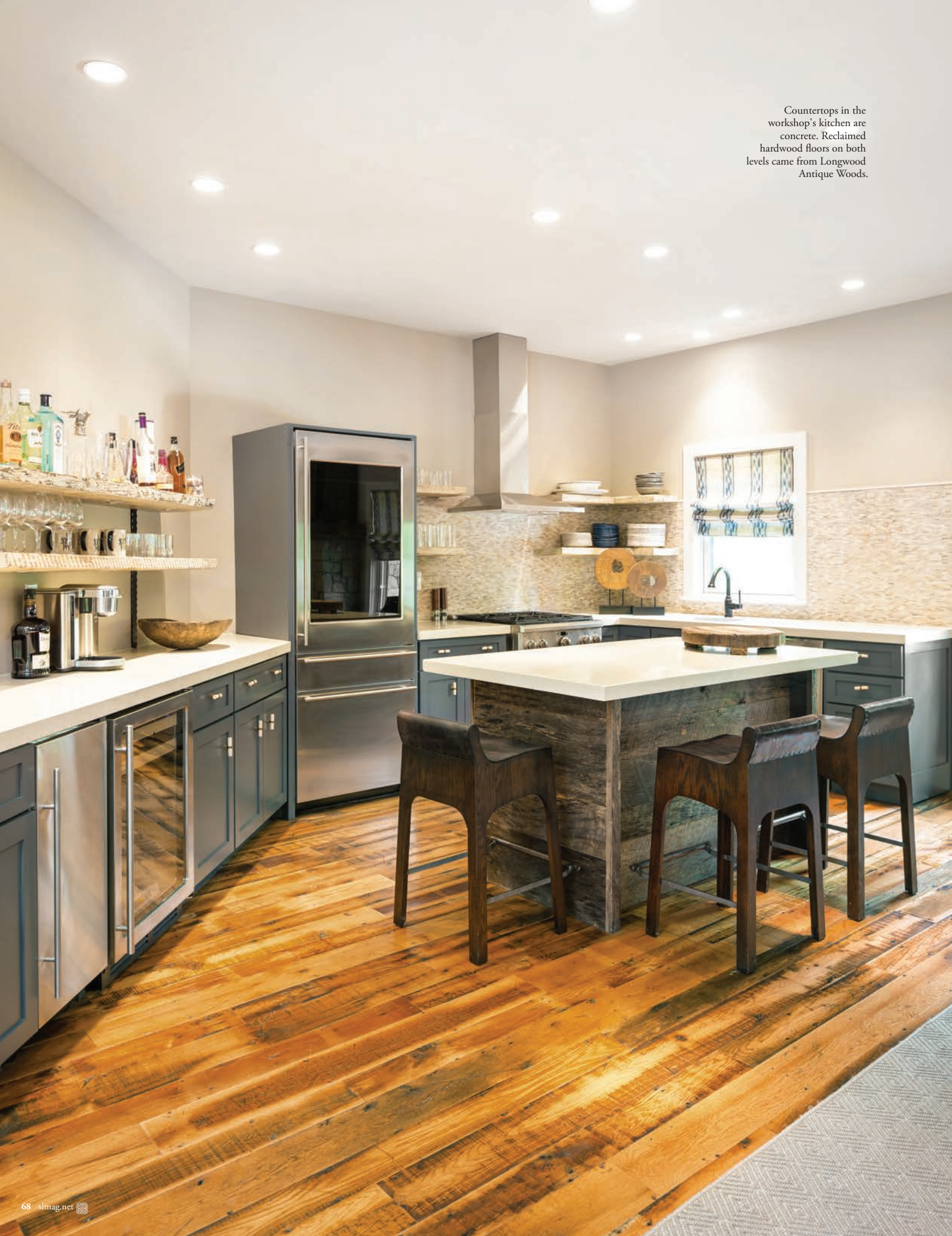
Countertops in the workshop's kitchen are concrete. Reclaimed hardwood floors on both levels came from Longwood Antique Woods.